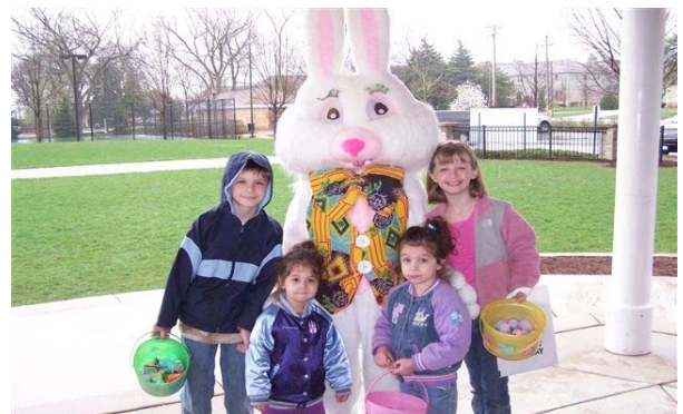
Having fun at the Easter Egg Hunt!

Thanks to ... Countryside Business Association, AT & T, Busy Builders/Busy Brushes, Continental Auto Group, Groot, Hunt Printing, Infinity Signs & Graphics, Inland Bank, Lyons Township, State Bank of Countryside, Tavern on La Grange, Vulcan Materials, Westfield Ford, and William Tell/Holiday Inn.