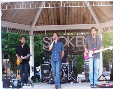
Once again, the Summer Concert series was a big success!