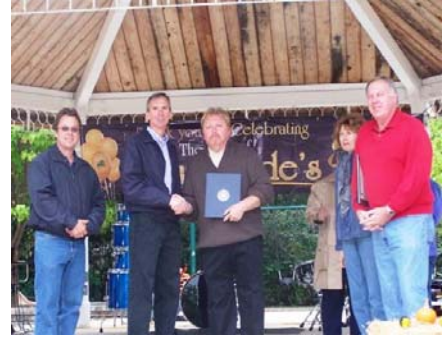
Congressman Lipinski congratulates Mayor Conrad and Elected Officials on the City's 50th Anniversary.