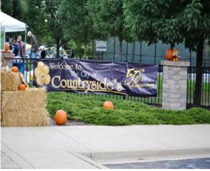
Countryside's 50th Anniversary celebration at Countryside Park On September 25, 2010.