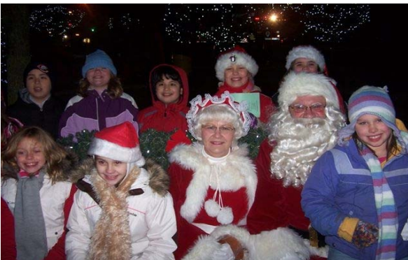
Children visited with Mr. & Mrs. Claus at the Tree Lighting Ceremony.