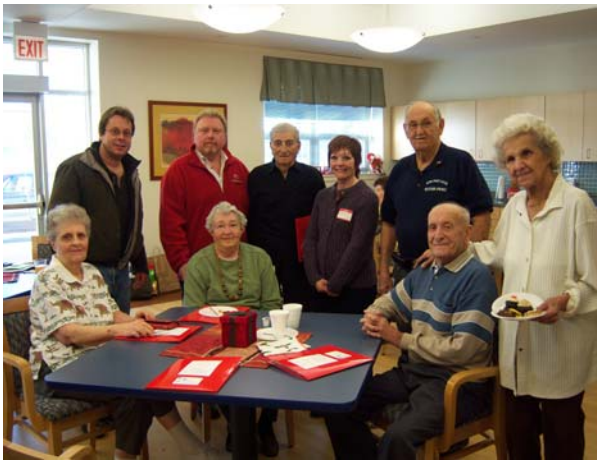
Reception party held at the Countryside Senior Apartments on December 8, 2010.

The programs and social services offered by Aging Care Connections are provided to adults age 60 and older and their family members. Programs and services are designed to provide options for care to seniors in order to enhance their ability to remain as independent as possible in their own communities.