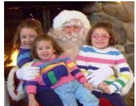
Smiling with SANTA at the annual Children's Christmas Party.