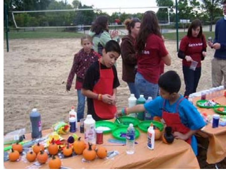
Some of our younger residents enjoying the festivities at the party in the park.