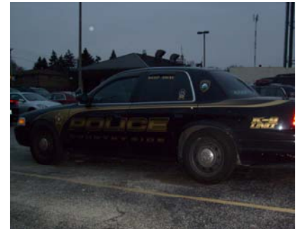
Side-by-side comparison of reflective vs. non-reflective striping.